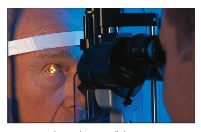
A cataract patient undergoes a slit-lamp exam.

Your surgeon may use additional dilating agents or a device to stabilize your iris to minimize the risk of complications.