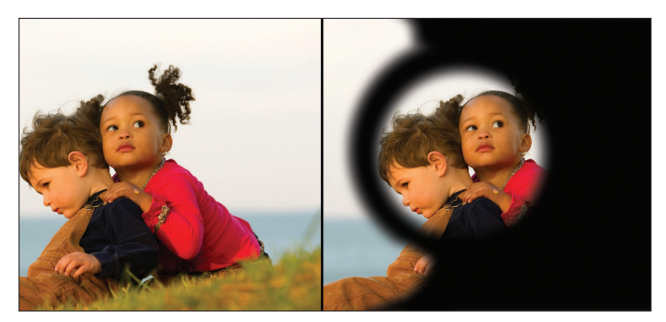
A normal visual field is represented in the image on the left. The image on the right is an example of severely damaged vision.